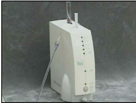
A computer injection system

The CompuDent system, featuring the Wand, is a new computer technology that helps reduce the discomfort associated with the anesthetic used to numb your teeth before treatment.