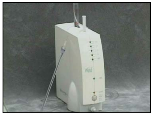
A computer injection system

The Compudent system, featuring the Wand, is a new computer technology that helps reduce the discomfort associated with the anesthetic used to numb your teeth before treatment.