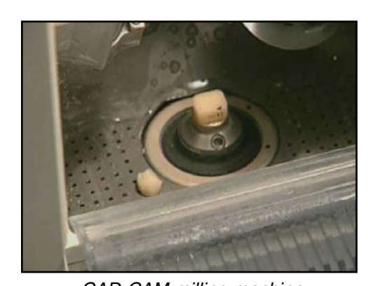
CAD-CAM milling machine

Finally, we try in the new restoration, add any necessary staining, and bond it in place. After we check your bite and make any necessary adjustments, you'll have a new CAD-CAM restoration, in just one appointment!