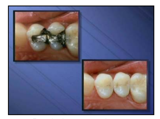
Results in one appointment