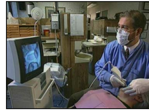
Creating a digital impression

In the past, the process of making an inlay or onlay involved a series of appointments in our office, followed by the fabrication of the restoration in a dental laboratory. Today, we have a new technology called CAD-CAM that allows us to custom create tooth-colored restorations, crowns and veneers right here in our office. In a single appointment, we can prepare your tooth, create the restoration, and cement it in place!